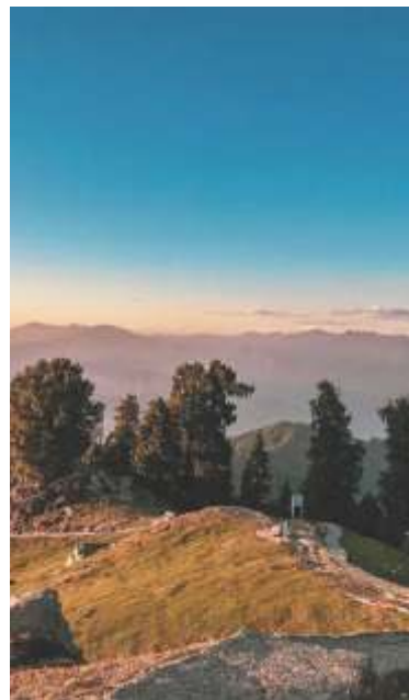
Pohlani Mata Mandir